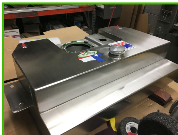
Center fill fuel tank.

To calculate capacity L \times W \times H = then / 231 this will give you U.S. gallons