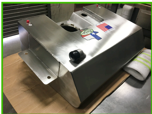
Side fill fuel tank.

For truck applications we offer side fill or center fill for the bed of the truck